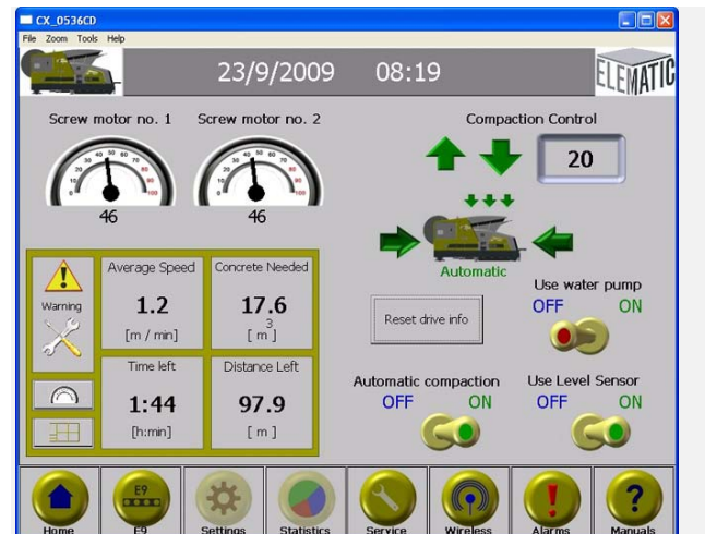
The extruder touch-screen main menu